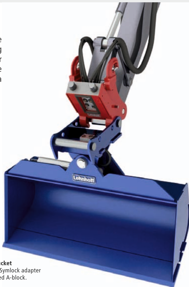
Variolock with shovel bucket Hydraulic tilt bucket with Symlock adapter and symmetrically arranged A-block.

"Never change the winning team!" - Inspired by this motto, we have not only considered the continued use of your existing attachments by keeping the Lehmatic housing and adapter sizes. Thanks to symmetric valve geometry, you can also use hydraulic tilt buckets as shovel buckets with the help of a Symlock adapter.