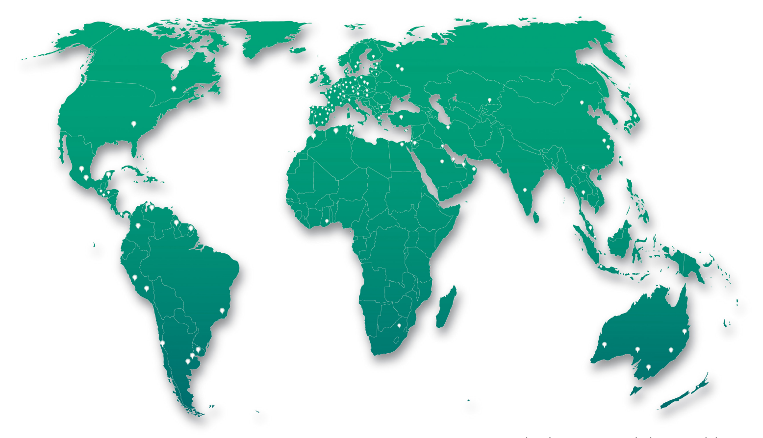
150 dealers around the world! Find yours: www.montabert.com